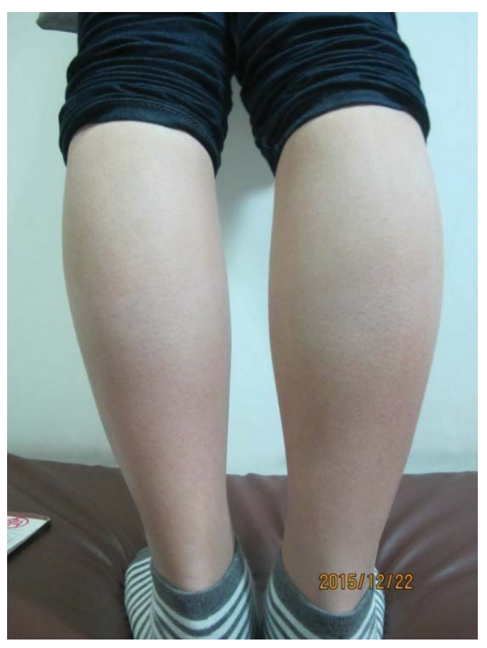
Figure 3: There is no recurrence at 10 months follow-up (12/22/2015)