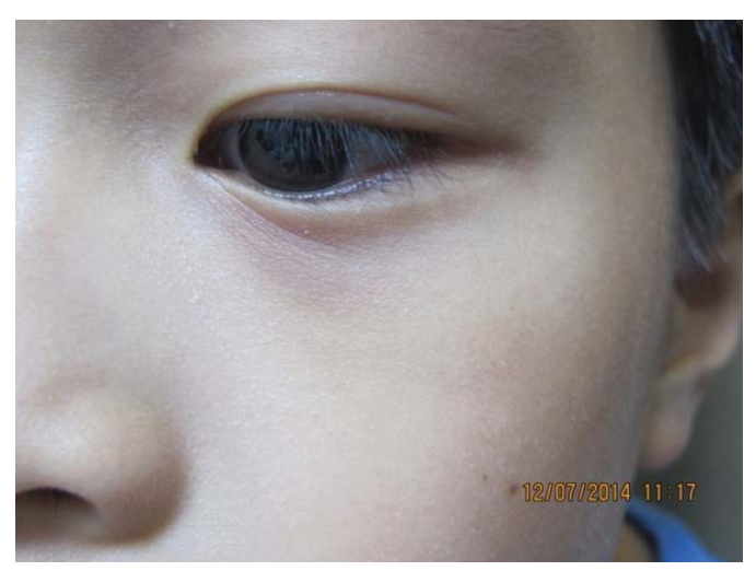
Figure 7: A complete clearance of café au lait spot on the left infraorbital area (after treatment with Golden Parameter:7/12/2014)

Third, in case of CALS on face, 30 GPT sessions are performed once a week. Small lesion with a diameter of less than 2cm requires 30 treatment sessions on a weekly basis. And large lesion with a diameter of larger than 3cm needs 50 treatment sessions once a week. In case of CALS on other parts of body (arms, legs, and torso), more than 50 GPT sessions should be performed once a week regardless of the size of lesion. The advantage of GPT is that it minimizes the epidermal damage without petachiae and crusts so this therapy does not cause PIH. But GPT requires a long-term treatment for one year. In this study, 32 patients with a solitary CALS (Figure 1,4 and 6) were