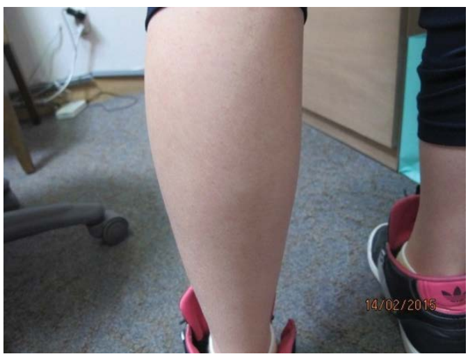
Figure 2: A complete clearance of café au lait spot (after treatment with Golden Parameter:2/14/2015)

J Dermatol & Ther, 2016 Volume 1(1): 2-4