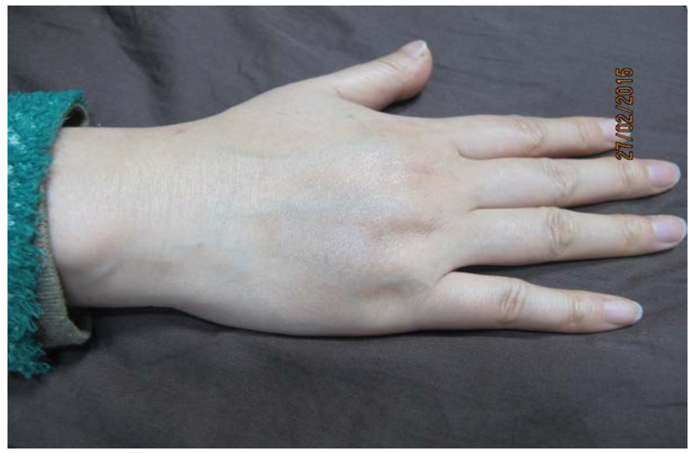
Figure \ 5: A\ complete\ clearance\ of\ caf\'e\ au\ lait\ spot\ on\ the\ right\ hand\ (after\ treatment\ with\ Golden\ Parameter: 2/27/2015)

J Dermatol & Ther , 2016 Volume 1(1): 3-4