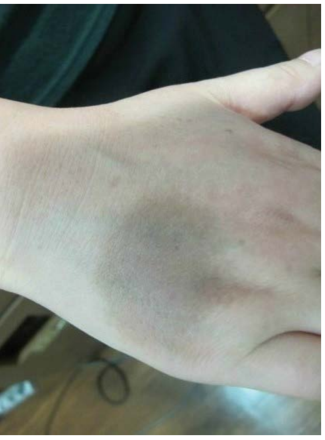
Figure 4: A solitary round brown patch on the right hand (before treatment:2/15/2014)