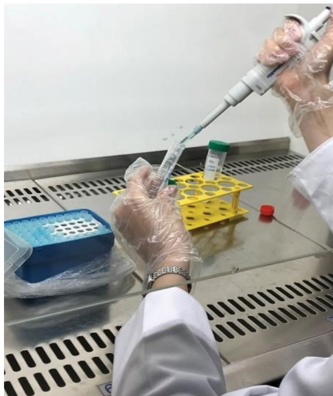
Figure 3: Prepare a suitable culture medium

MSSCs were successfully isolated and cultured from human umbilical cord and injected into 10 infants over an intermittent therapy. After a year, this complication improved to a large extent, and the gap between the two lips was resolved, and with the continuity of treatment, the cleft palate of these babies was improving. According to the tests and studies, the extraction and culture of the mesenchymal stem cells from the cord takes less time. The amount of cells produced by this method is treated in this way up to 90% and without any side effects. Figure 4.