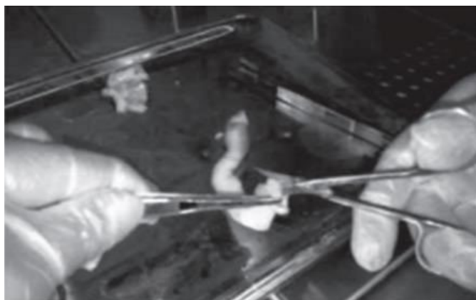
Figure 1: Segmentation of the umbilical cord from Wharton's jelly